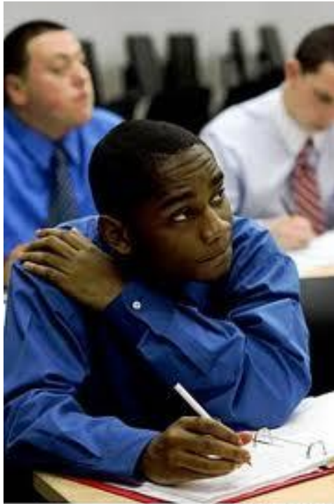
Liz Hafala / The Chronicle